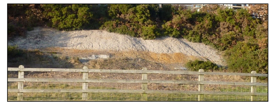
The old sea cliff RIG Site 2010

This old sea-cliff has now partly disappeared under the landfill of the recreation ground. The white clay is named the Parkstone Clay, the highest clay in the Poole Formation, previously known as the Pipe Clay Series. The other clays are Broadstone, Oakdale and Creekmoor, named from the areas of Poole where the clay reaches the surface.