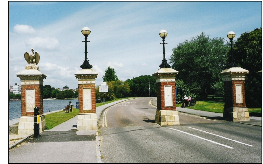
The park gates development.