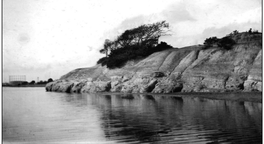
The old sea cliff before landfill

This old sea-cliff has now partly disappeared under the landfill of the recreation ground. The white clay is named the Parkstone Clay, the highest clay in the Poole Formation, previously known as the Pipe Clay Series. The other clays are Broadstone, Oakdale and Creekmoor, named from the areas of Poole where the clay reaches the surface.